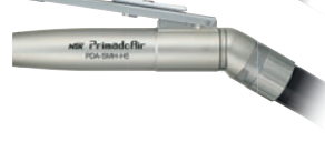
Order Code PDA-SMH-HS Primado Air Slim Motor/HS • Hand Control Type